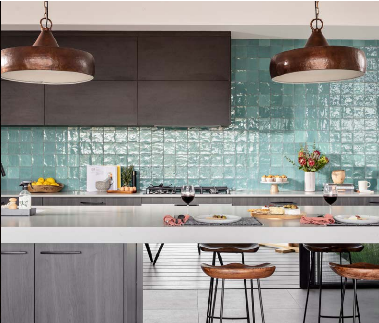
Bora Professional R2T from Winning Appliances

RANGEHOODS HAVE BECOME A THING. CONTEMPORARY KITCHENS ARE NOW SHOWCASING THIS APPLIANCE.