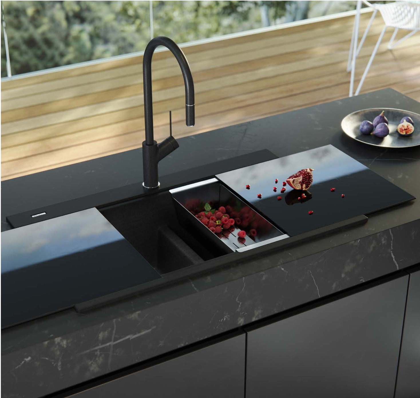
Oliveri Santorini Black double Bowl topmount sink with Glass top