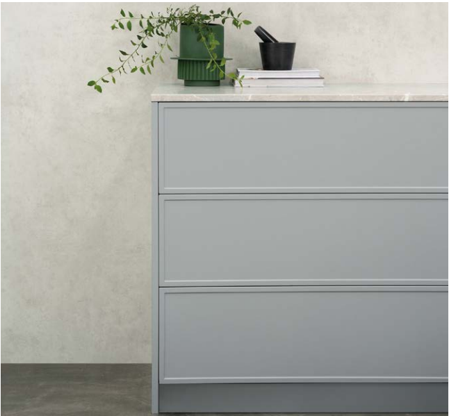
Polytec Sussex Profile

Crisp whites and a modern colour palette define this style. Modern Farmhouse kitchens can include glass fronted cabinets or you may decide to feature open shelving or boxed shelving instead.