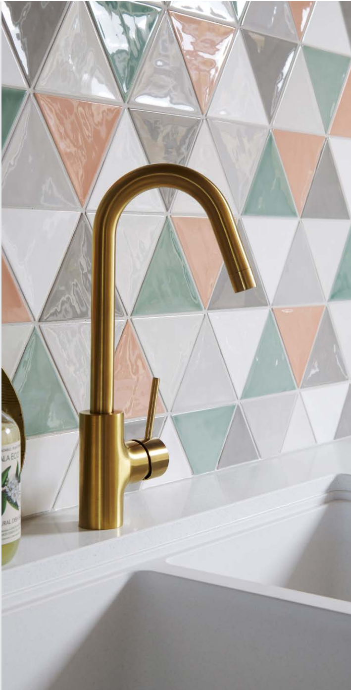
Franke White Fraganite Sink