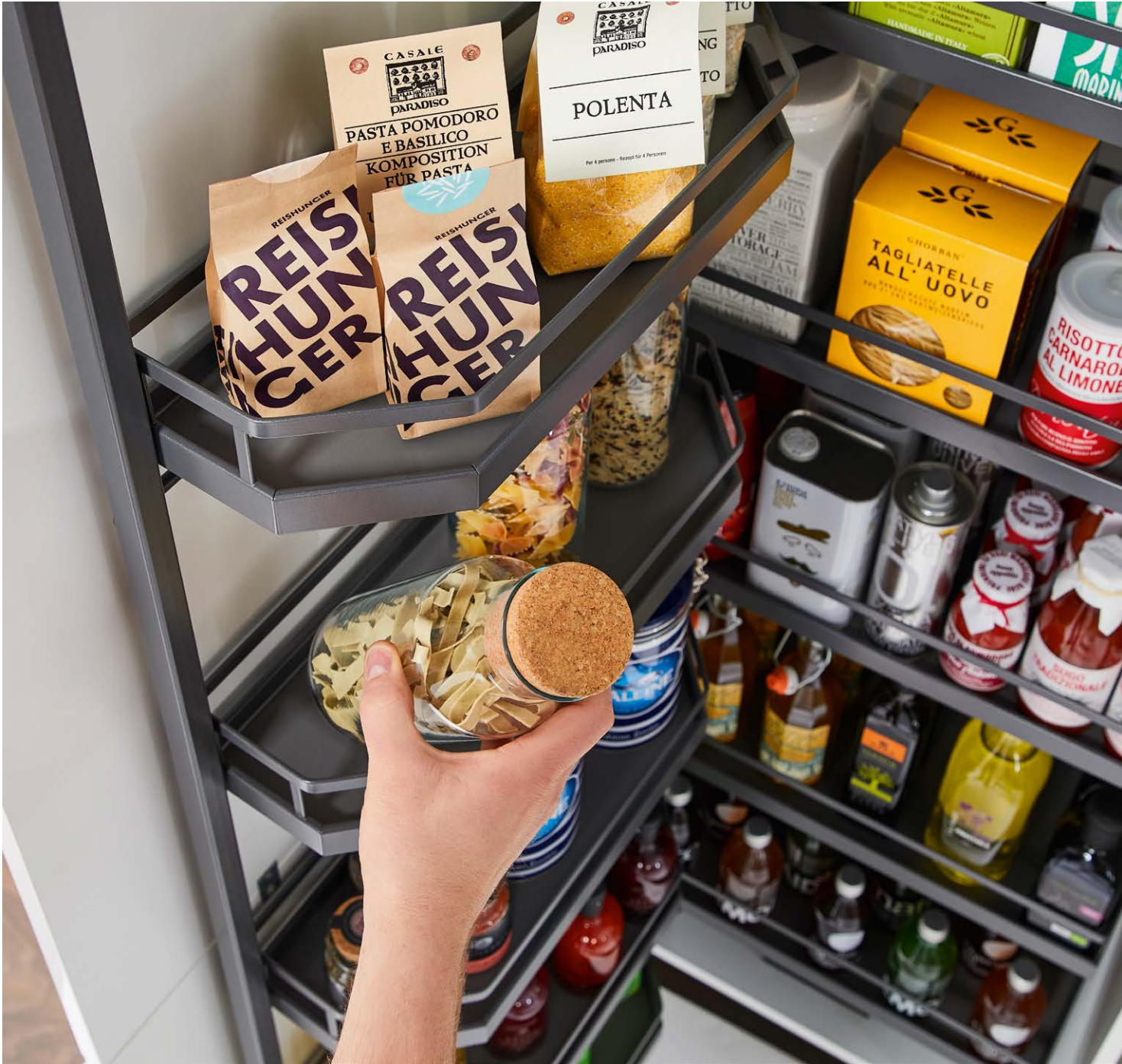
Hafele Tandem Pantry Anthracite