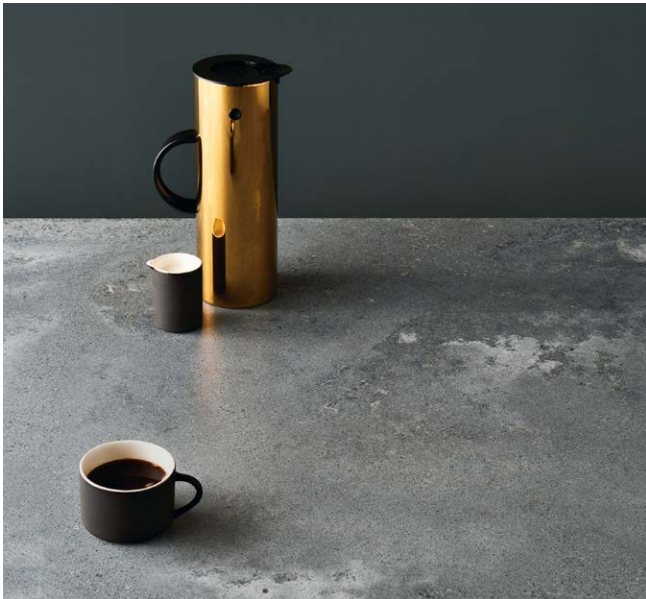
Caesarstone Rugged Concrete 4033