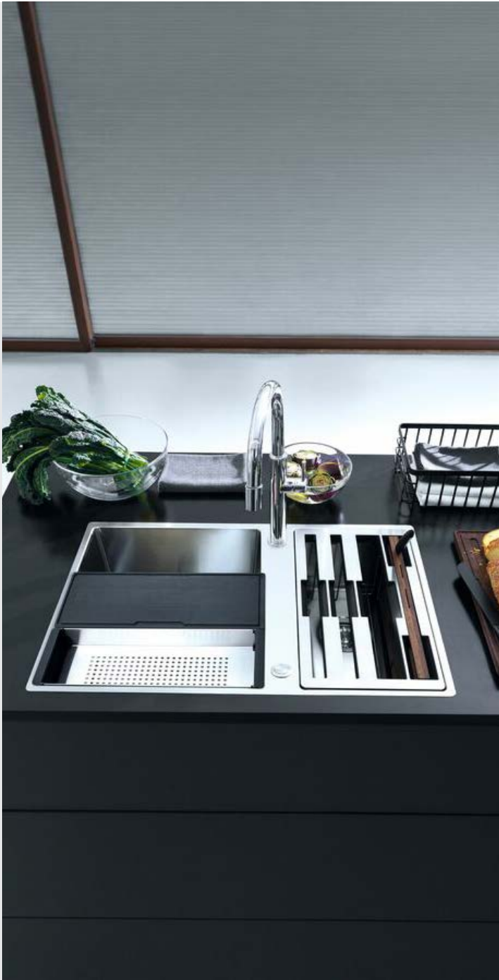
Franke Bow Prep